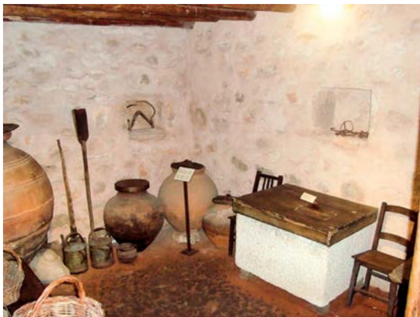
Inside the home of the Marto family

The dominant thought which haunted her and animated all her supernatural activity was the salvation of souls. She had an ardent thirst for their conversion, a genuine missionary zeal. She looked for sacrifices to offer for “my sinners.” She renounced her favorite pastime of folk dancing for the conversion of sinners. She always made her sacrifices with this thought, a thought which was habitual for her: to suffer for sinners, to make acts of reparation in their place,